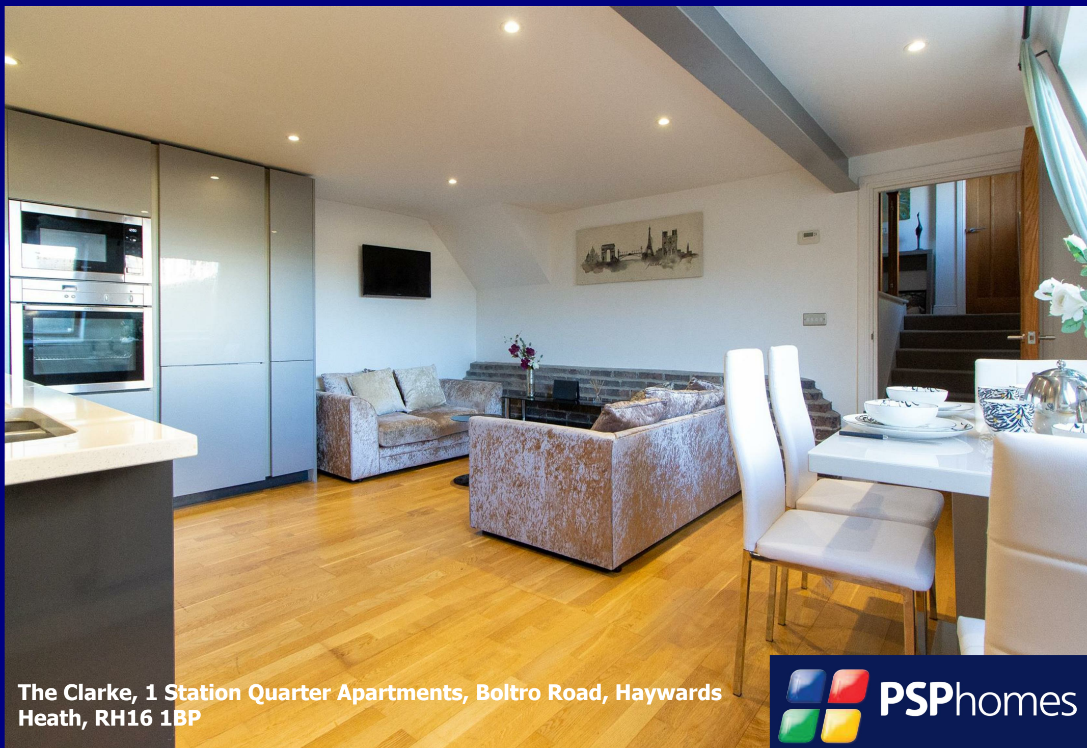
The Clarke, 1 Station Quarter Apartments, Boltro Road, Haywards Heath, RH16 1BP